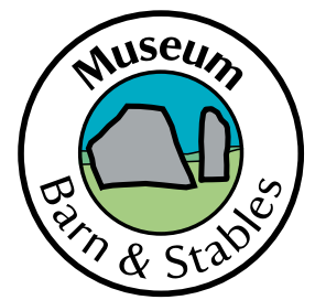
Museum: gateway to Avebury World Heritage Site

In the Old Farmyard you'll find the Alexander Keiller Museum: your gateway to Avebury World Heritage Site. Housing archaeological treasures from Avebury it reveals the mysteries of this ancient place. The seventeenth century threshing barn forms one half of the museum and is home to five species of bats. Nearby you'll find a sixteenth century manor, tranquil garden, dovecote, shop and café.