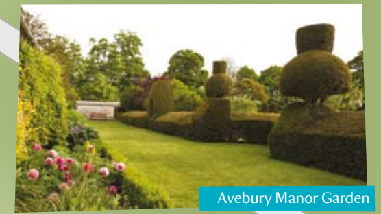
Avebury Manor Garden