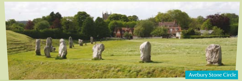
Avebury Stone Circle